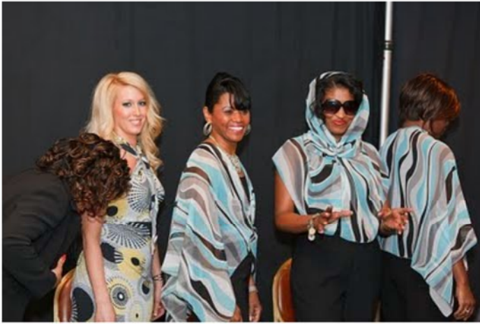
Backstage at the No-Fuss Scarves Fashion Show

Designers of all kinds to be compassionate toward women of need with fashion! As a Women, no matter what our status, circumstances, or race, we strive to look our best. I stand by my motto: "Encouraging Women to Look and Feel Beautiful". I am happy to donate pieces of my product to The Compassion Fashion Project to be used toward a charitable cause."