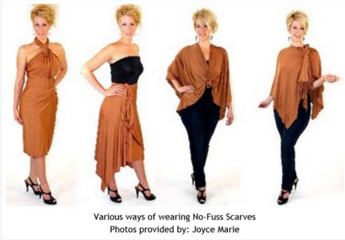
Various ways of wearing No-Fuss Scarves